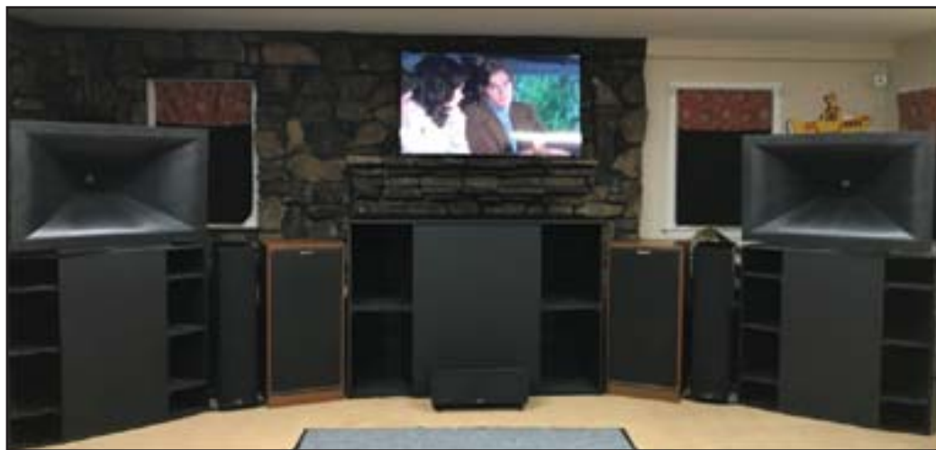
The Cooper's "Wall of Sound"