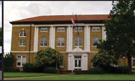
City Hall (Klipsch Auditorium)