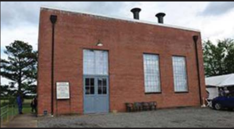
PWK Education Center