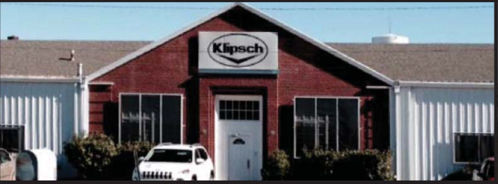
Klipsch Hope Manufacturing Facility (Factory)