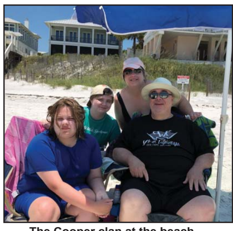
The Cooper clan at the beach